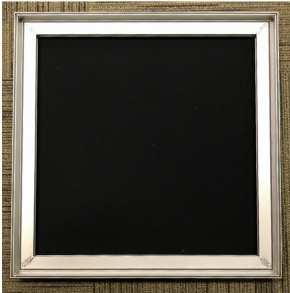
24" x 24" SEG frame